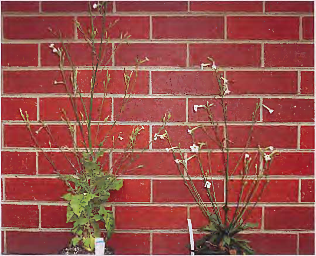
Figure 2. Habits of plants at first flowering. N. maritima at left and N. 'Cape Schanck' at right. Cultivated, RBGV Melbourne nursery.